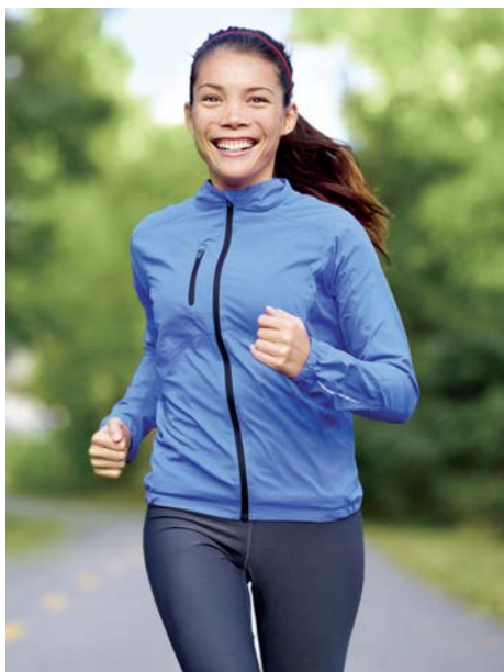
Allergic runners jog easily in rain, but not thunderstorms.

Weber says that such a storm creates a strong downdraft, and that stirs up the grass pollen. The turbulence knocks tiny allergen-coated granules out of pollen, which are easily inhaled into the nose and lungs. "When they're released, they're little packs of dynamite."