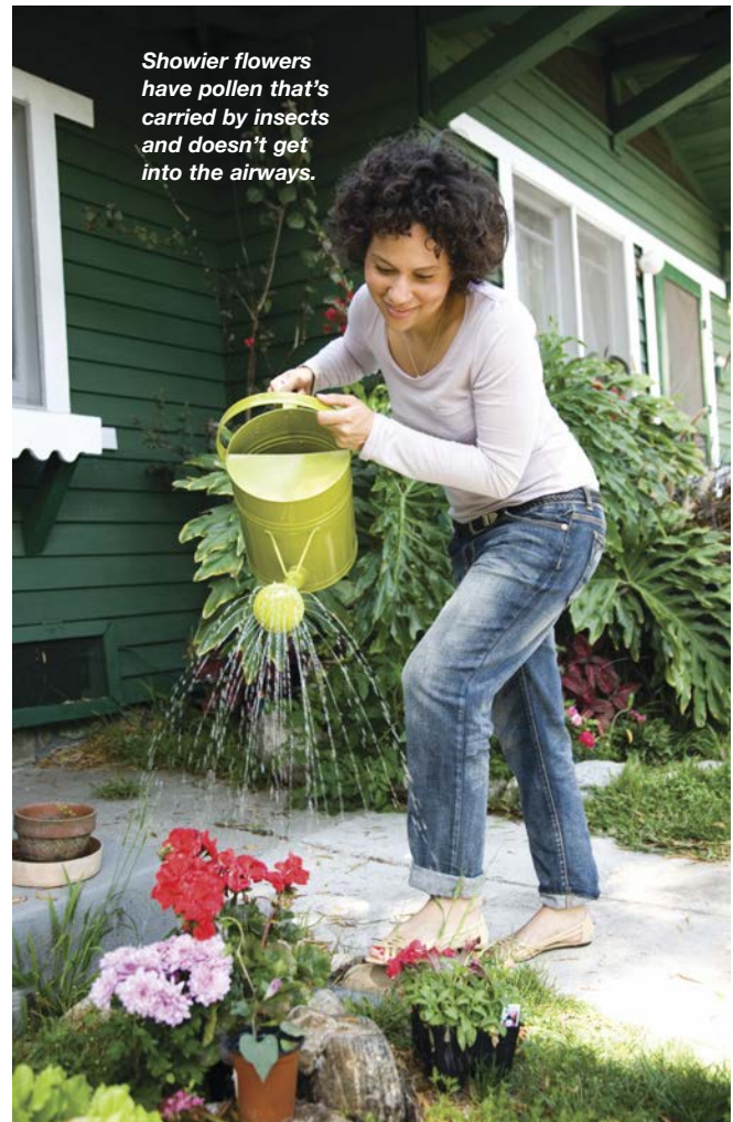
Showier flowers have pollen that's carried by insects and doesn't get into the airways.

Wallace says it's important to remember the nasal steroid sprays don't provide immediate relief. It can take two-to-four